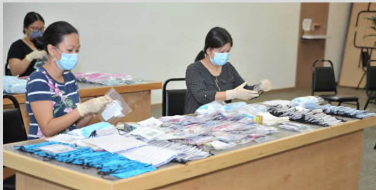
The Hawaii PHA made reusable masks for elderly and disabled residents.